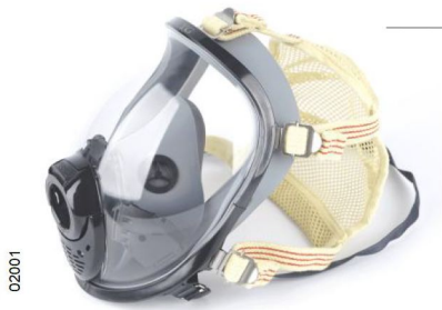
Full face mask DSM-1