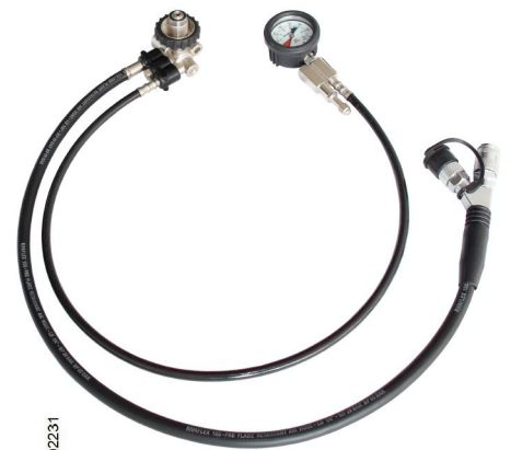
Pressure reducer unit