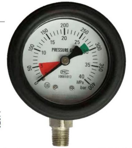
Mechanical pressure gauge DSJYB-1