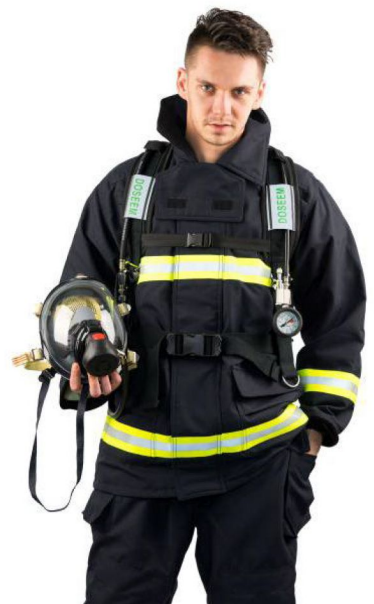
Article number: 01101

During service and maintenance, in order to minimize downtime and minimize costs, DSBA6.8P incorporates a number of unique designs, all of which can be easily removed or reconnected from the backplane using simple tools. The strap is attached to the backing plate by a single adjustment of the innovative design. The snap connection of the primary pressure relief valve allows the pneumatic section to be quickly installed or removed from the respirator. The tubing can be quickly removed and cleaned from the backing plate.