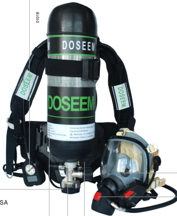
Pressure gauge cylinder valve KHF-30SA