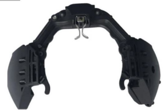
Full face mask DSM-1