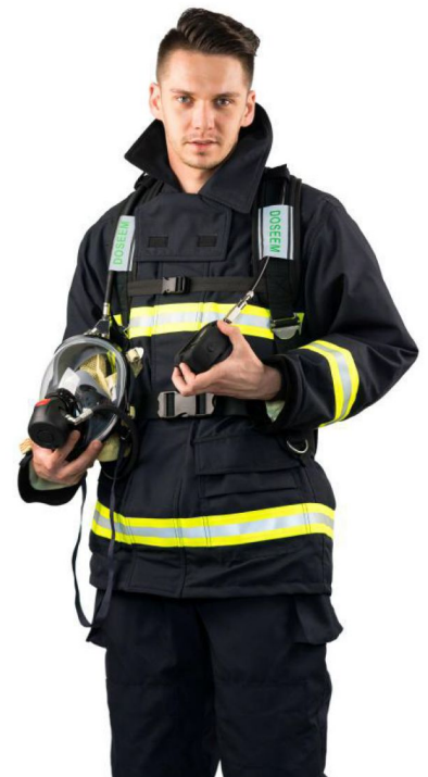
Article number: 01209

DS-RHZKF9/A uses state-of-the-art harness materials designed to withstand the high wear and tear that operation personnel face every day. The product is equipped with a durable stainless steel lock and a long-life aramid blending belt, making it ideal for long wear and frequent use.