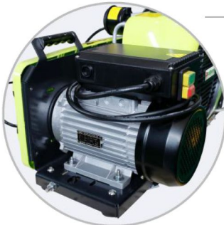
Three Phase Electric Motor