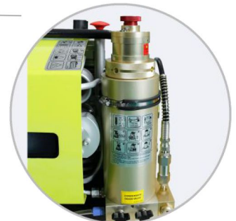
Active Carbon Molecular Sieve Filter