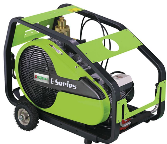
Article number: 06012