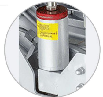
Oil Filling Barrel