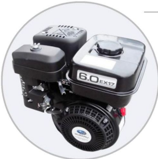
Three Phase Electric Motor