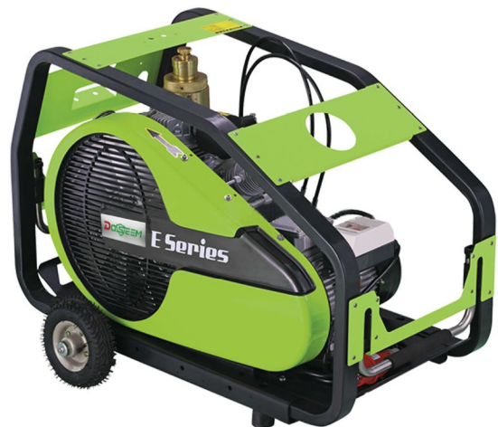
Article number: 06013