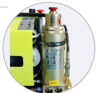
Active Carbon Molecular Sieve Filter